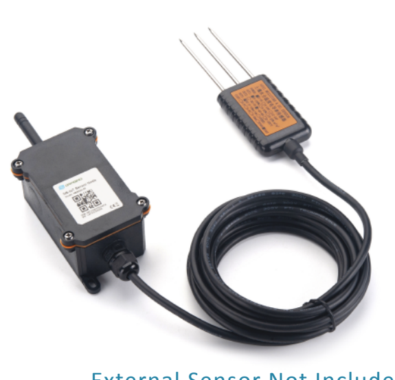
External Sensor Not Included